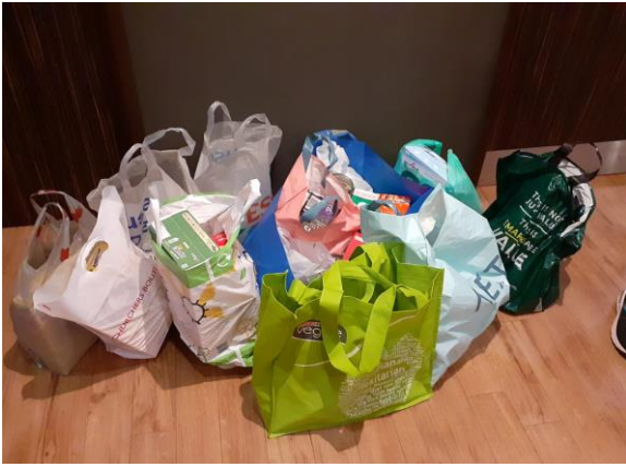
Tuesday's Food Bank Run Stash!