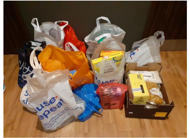
Thursdays Food Bank Run Stash!