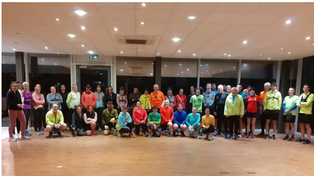
Thursday's Food Bank Run Team! (Sorry I didn't get a photo of the Tuesday Team) You are all amazing!!