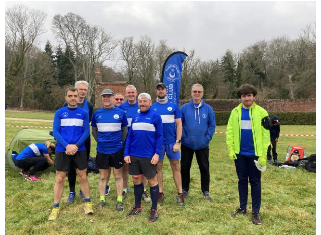
Final SCCL Race – Men’s Team