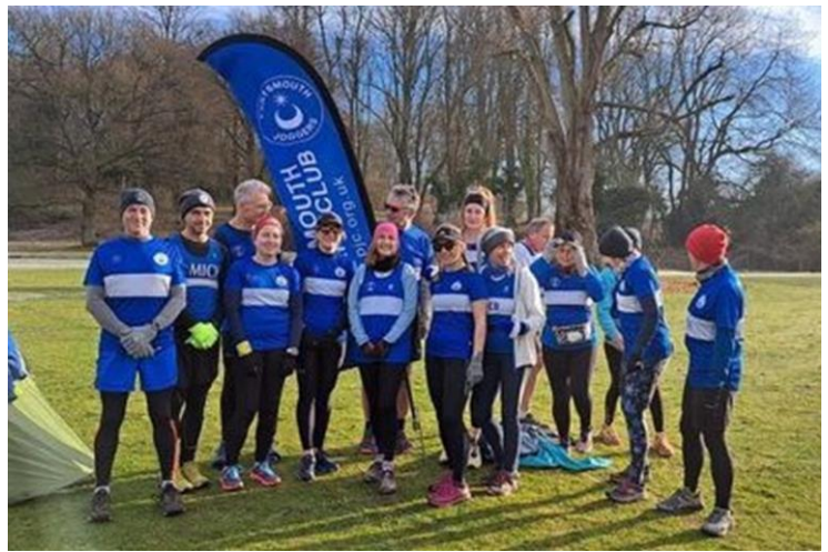
SCCL Race Team – Chawton House