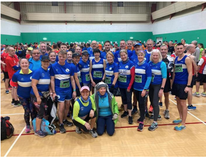
Portsmouth Joggers Team