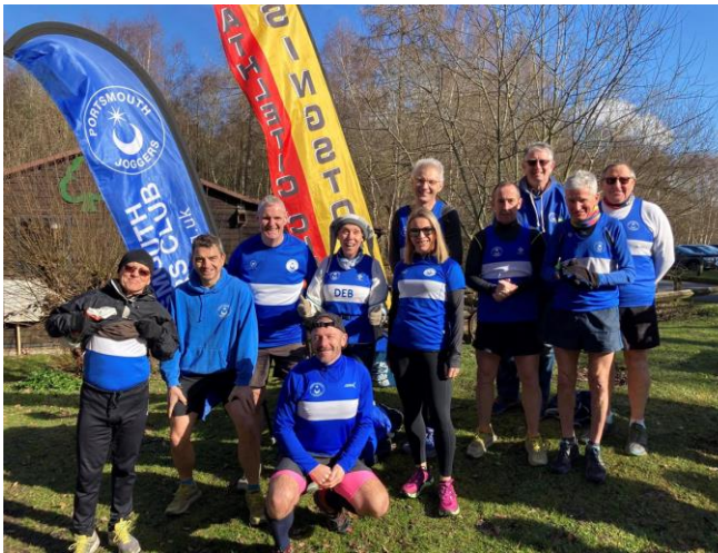
SCCL Race Team – Alice Holt