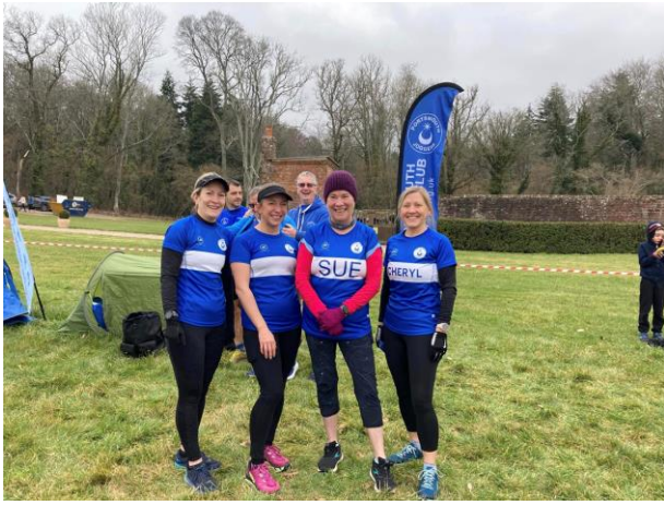
Final SCCL Race – Ladies’ Team