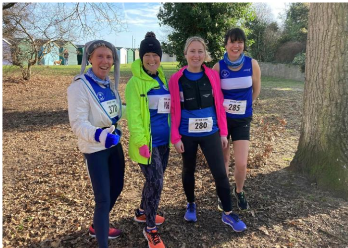
Portsmouth Joggers Ladies' Team