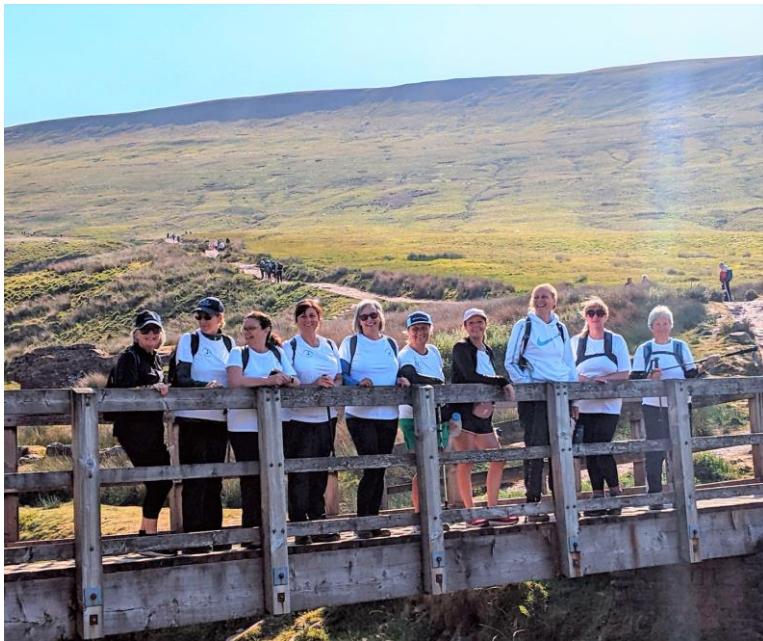
On The Way Up Pen-Y-Fan